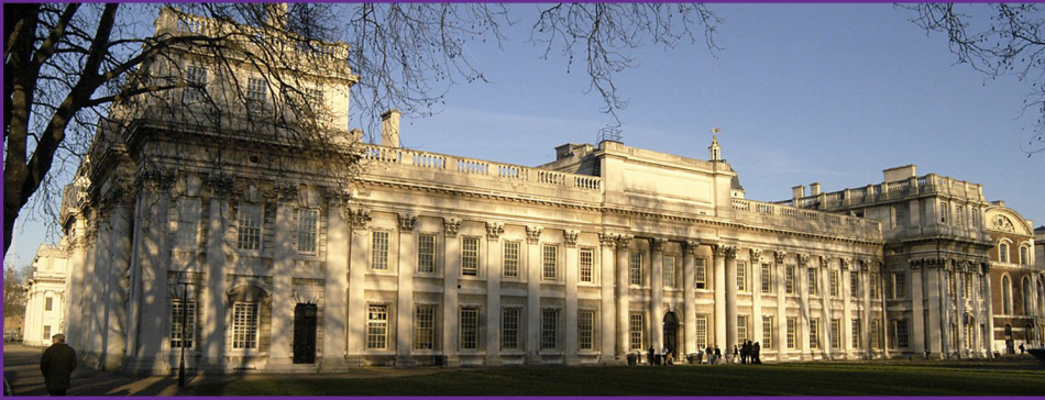
Trinity Laban Conservatoire, Greenwich