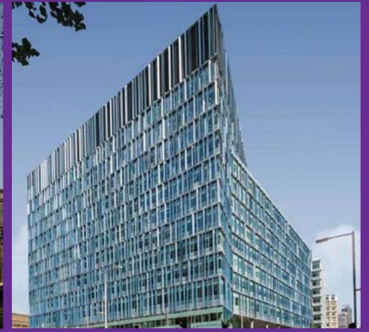
Blue Fin Building, Southwark

Trinity College London believes that effective communicative and performance skills are life enhancing, know no bounds and should be within reach of us all.